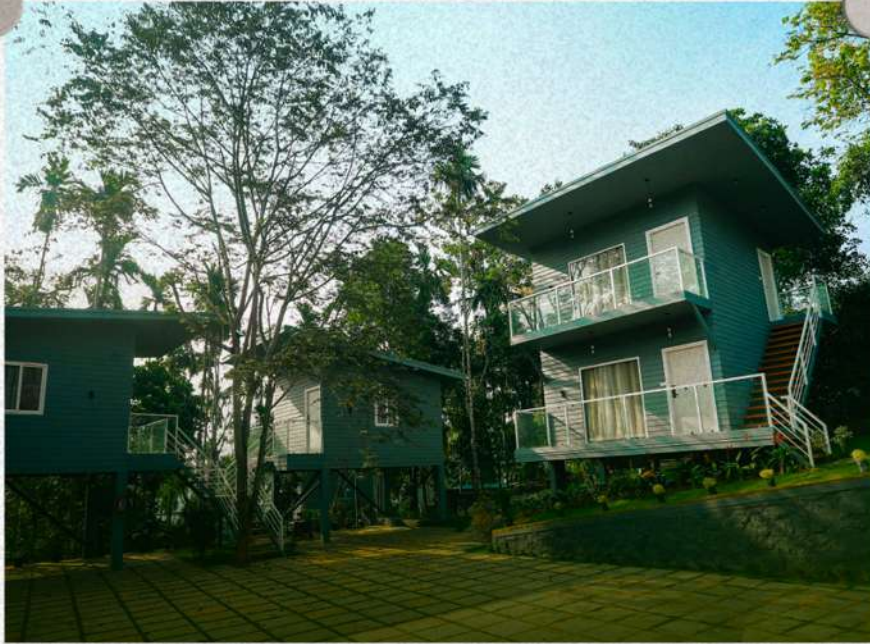
Le Valor Resorts by Crezenta

Since the birth of our first shopping complex in 1992 in India, CIG has been offering reverting shopping haven for shoppers of all ages via their numerous shopping complexes scattered throughout Kerala.